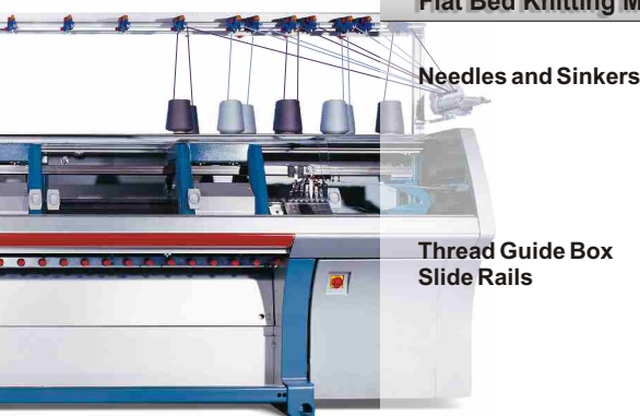
Needles and Sinkers